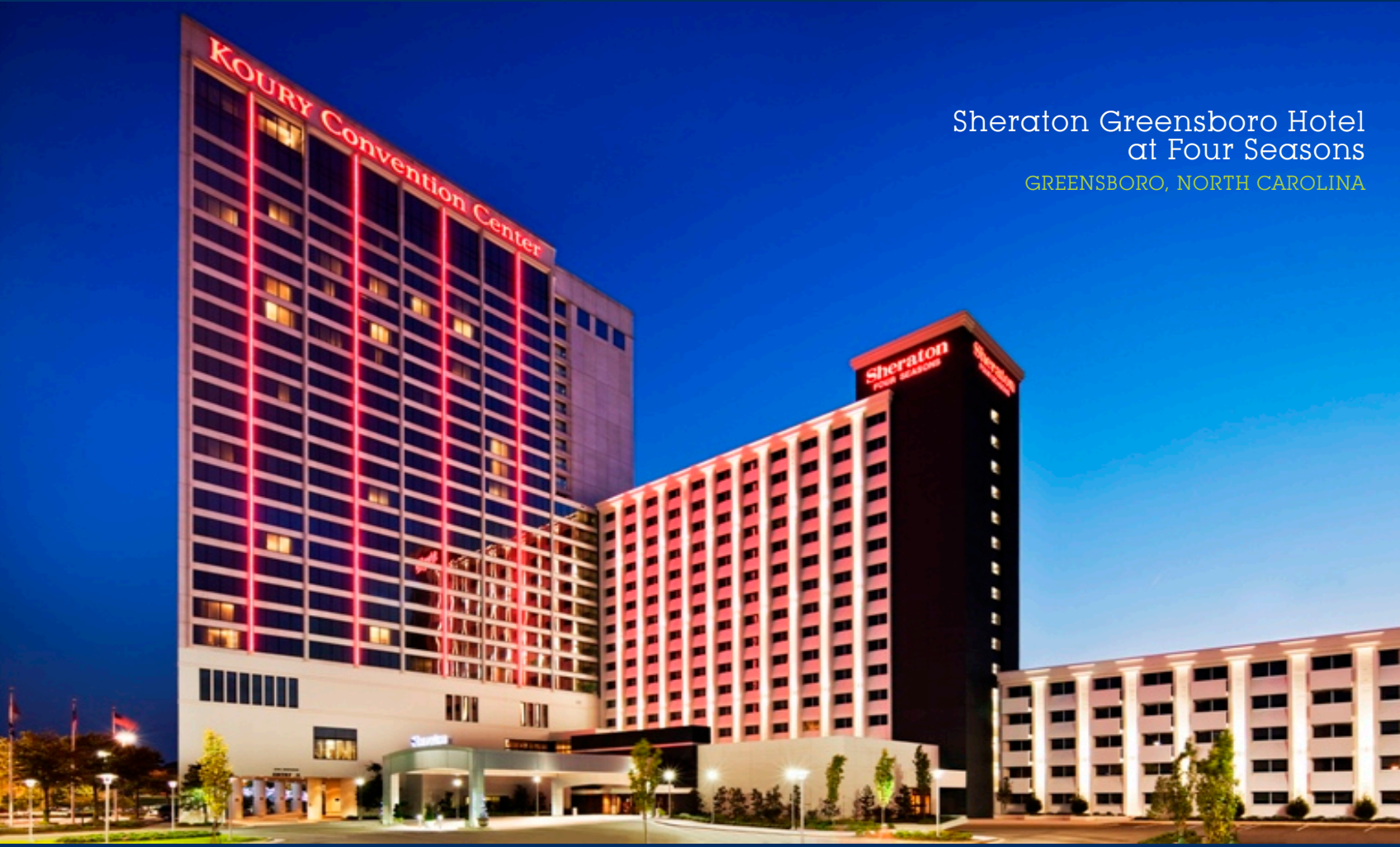
Sheraton Greensboro Hotel at Four Seasons GREENSBORO, NORTH CAROLINA